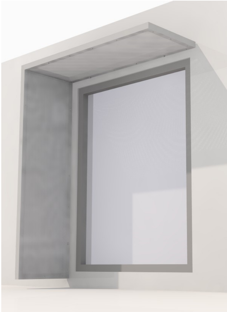
A Standard Assembly